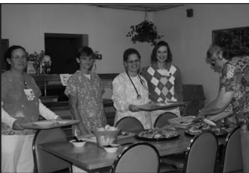
Employees enjoy free subs, pizza and cake for lunch.

A celebration was held recently to reward HVCH employees for achieving 91% in the 2nd quarter Inpatient Patient Satisfaction scores. Satisfaction is measured by a National research company and compiled quarterly.