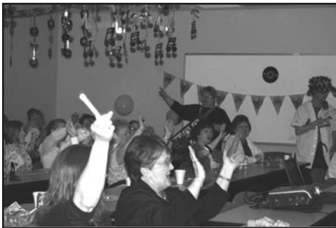
Employees enjoying the "Celebration".

The Spring employee forums were said to be both entertaining and informative, according to the employee evaluations. Logo apparel orders have been placed, and they are expected to arrive on May 8. The next order will be placed in August.