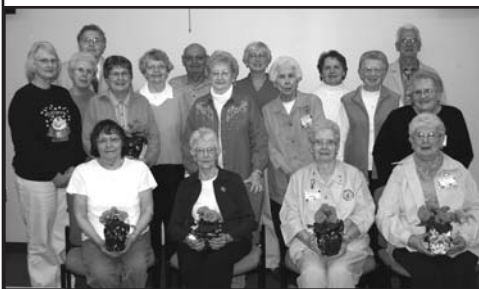
In-Service volunteers shown at at recent special event.

HVCH is fortunate to have 49 Auxiliary members and 27 in-service volunteers. These special men and women donated more than 8,200 hours in 2007. We currently have volunteers in 7 departments, Patient Registration, Outpatient Registration, SNF, Materials Mgmt., Pharmacy and Community Relations. We encourage you to view the bulletin board across from the IS Dept. It features our in-service volunteers.