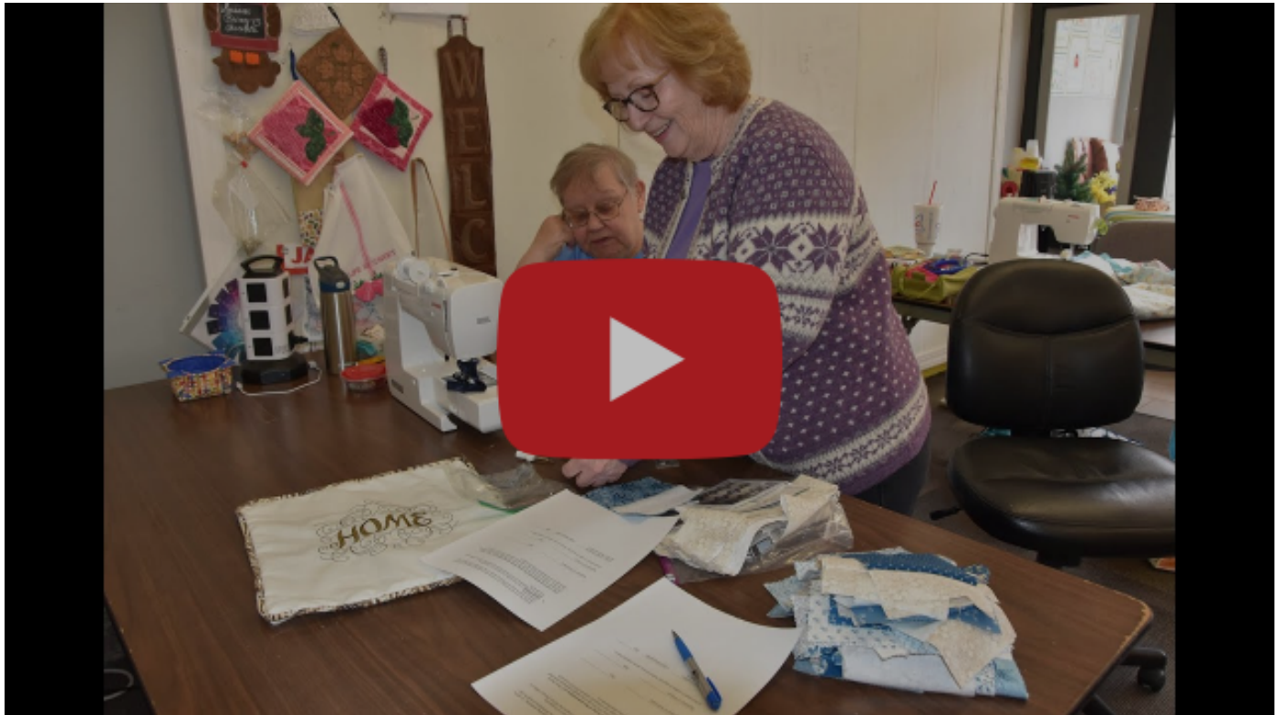
Stress Therapy with Nelsonville Quilt Company