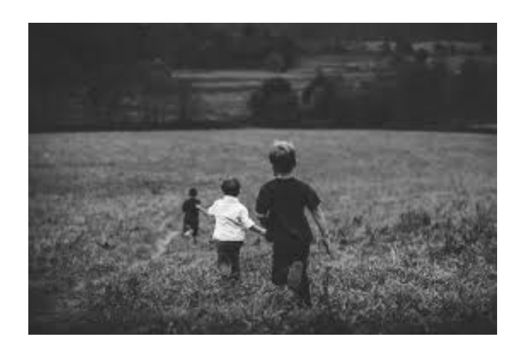
Numbers 6:26 26 The Lord lift up His countenance upon you, And give you peace."

What memories do we have with God that will make you better? I pray you have memories with the Father.